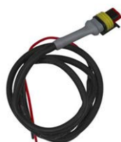
Control cable for Cyrix-ct 12/24-230 Length: 1 m