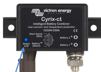
LED status indicator