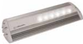
POWERLUX PIR (SI3_6-1PIR)