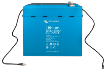
12,8V 300Ah LiFePO 4 Battery

Very useful to localize a (potential) problem, such as cell imbalance.