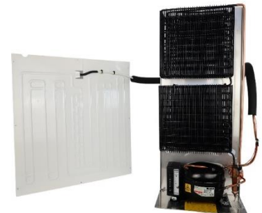
Article number: 322123