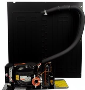
Article number: 322110