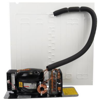
Article number: 322021