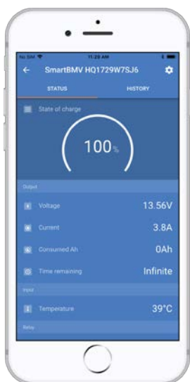
See the VictronConnect BMV app Discovery Sheet for more screenshots