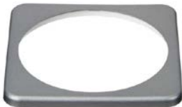
BMV bezel square