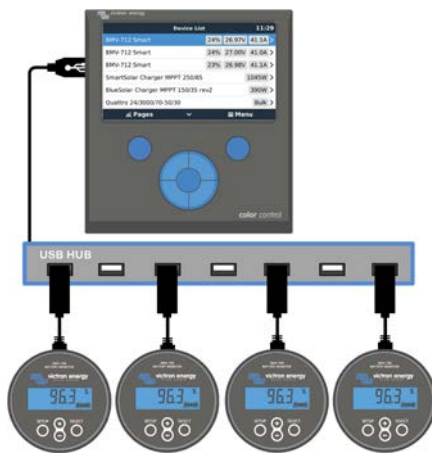
A maximum of four BMVs can be connected directly to the Color Control. Even more BMVs can be connected to a USB Hub for central monitoring.