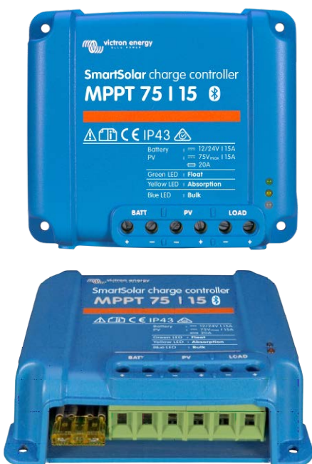
SmartSolar Charge Controller MPPT 75/15