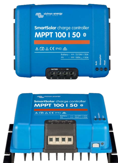
SmartSolar Charge Controller MPPT 100/50