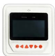
BlueSolar Pro Remote Panel