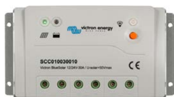
BlueSolar PWM-Pro 10A