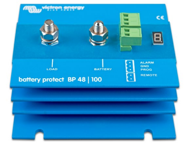
BatteryProtect BP 48-100

Victron Energy B.V. | De Paal 35 | 1351 JG Almere | The Netherlands General phone: +31 (0)36 535 97 00 | E-mail: <u>sales@victronenergy.com</u> www.victronenergy.com