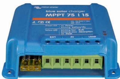
Solar Charge Controller MPPT 75/15