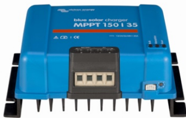
Solar Charge Controller MPPT 150/35