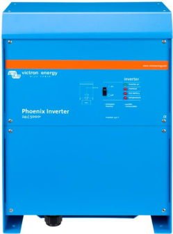
Phoenix Inverter 24/5000