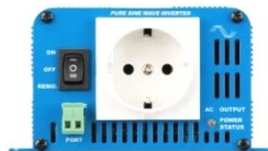
Phoenix Inverter 12/180 with Schuko socket