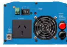
Phoenix Inverter 12/800 with AN/NZS 3112 socket