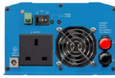
Phoenix Inverter 12/800 with BS 1363 socket